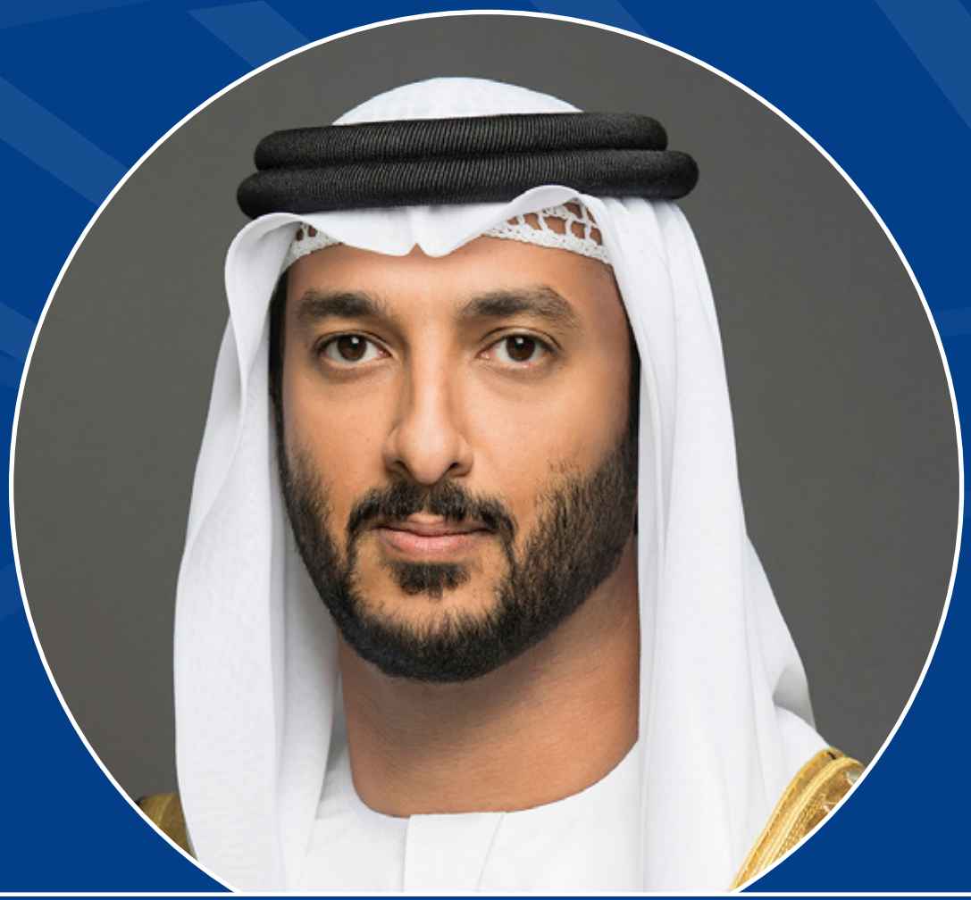
H.E. Abdulla Bin Touq Al Marri Minister of Economy United Arab Emirates